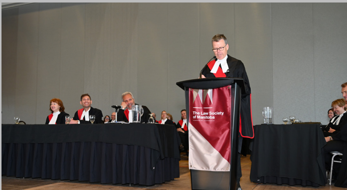
The Honourable Justice Herb Rempel speaks to the newly called lawyers.